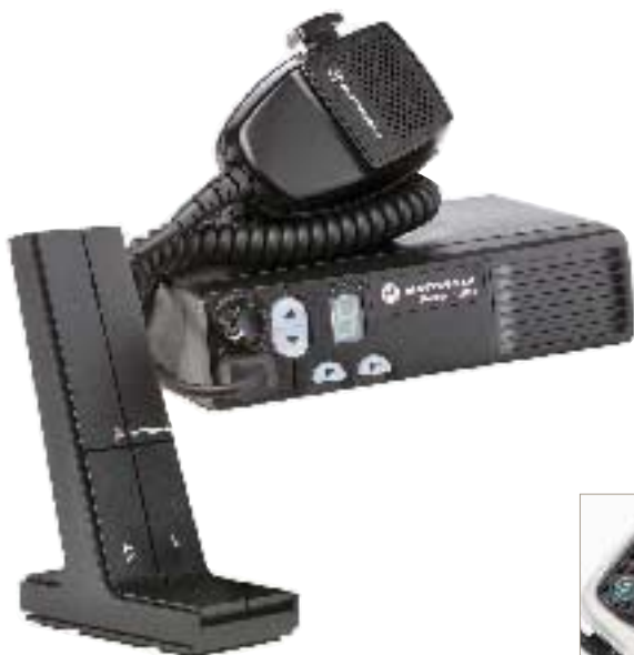
Compact microphone: HMN3596 Desktop microphone: RMN5068

For a detailed listing of all Motorola Original® accessories* available for your CM200 or CM300 mobile radio, see the Commercial Tier Accessories Catalog (RC-3-1008).