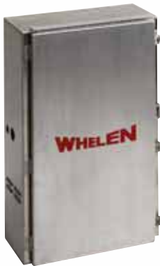
IPS 400/800 Type I Electronic Cabinet