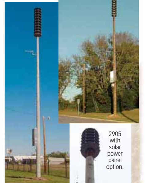
2905 with solar power panel option.