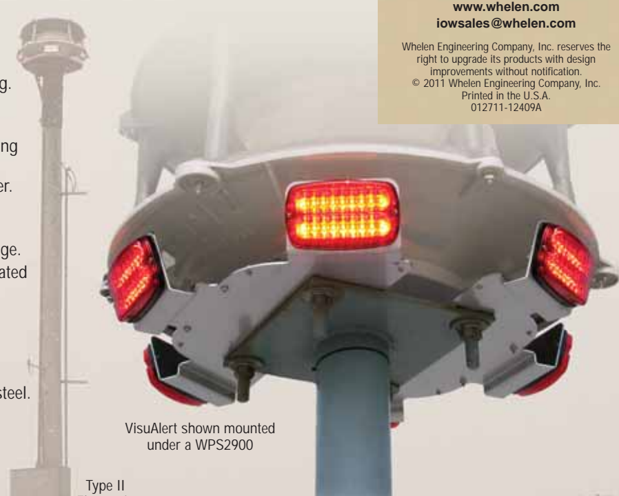
VisuAlert shown mounted under a WPS2900