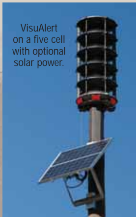
VisuAlert on a five cell with optional solar power.

* Denotes color Code: A -Amber, B -Blue, C -Clear (white), R -Red.