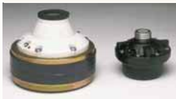
Whelen 400 Watt Speaker Driver shown with Standard 100 Watt Speaker Driver.