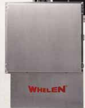
TYPE II ELECTRONIC CABINET

Ten models serve a wide variety of applications as shown here in ratio to a person's size.