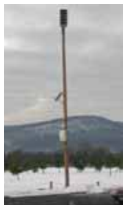
Whelen Model WPS2905 in the field on duty in Emmitsburg, Maryland.