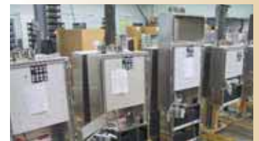
Type III Cabinet Assembly