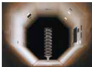
Whelen WPS2900 Series products are wind-tunnel tested to insure performance and reliability in the most trying conditions.