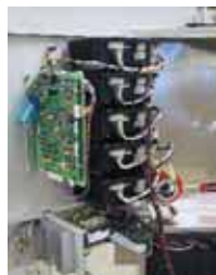
Type II Electronics Assembly detail.