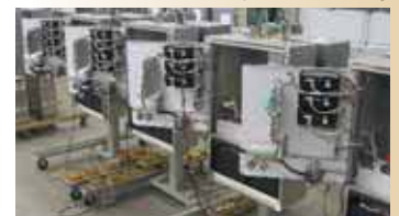
Type II Cabinet Assembly