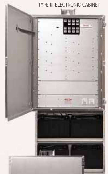
TYPE III ELECTRONIC CABINET