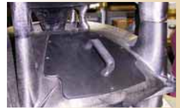
2900 Series Speakers Assembly